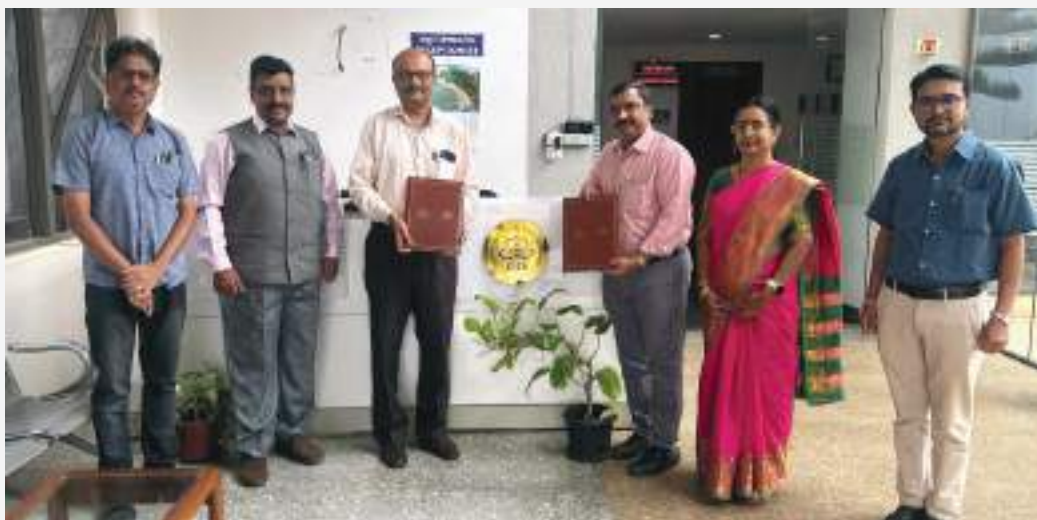
MoU with Karnataka Science and Technology Academy UR Rao Vijnana Kendra (29-08-2024)