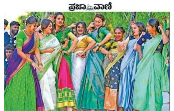
ಸೌಂದರ್ಯ ಸುಗ್ಗಿ... ಸೌಂದರ್ಯ ಕಲಾಪ್ರಿಯತೆ ಮತ್ತು ಸಂಸ್ಕೃತಿಯನ್ನು ಪ್ರದರ್ಶಿಸುತ್ತಿರುವ ಸೌಂದರ್ಯ ಸುಗ್ಗಿ ಪರ್ವ ಕಾರ್ಯಕ್ರಮದಲ್ಲಿ ವಿದ್ಯಾರ್ಥಿನಿಯರ ಸಂಭ್ರಮದ ದೃಶ್ಯ

On January 11, 2023, the College campus celebrated Sankranti as "Soundarya SuggiParva," a festival aimed at bridging the gap between native culture and students. The Department of Commerce organized the event under the forum "Akanksha," featuring rangoli, festoons, and floral accents. The event showcased student abilities and cultural heritage preservation.