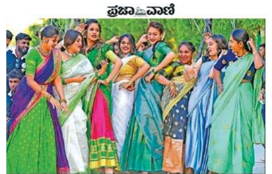
ಪೊದಯ್ಯ ಸುಗ್ಗಿ... ಸೌಂದರ್ಯ ಕಲಾ ಪ್ರದರ್ಶನದ ಮೂಲಕ ಸಂಸ್ಕೃತಿಯನ್ನು ಪರಿರಕ್ಷಿಸುವುದು ಮತ್ತು ಅದನ್ನು ಪ್ರಚಾರಿಸುವುದು. ಸಂಸ್ಕೃತಿ ಮತ್ತು ಸಾಂಸ್ಕೃತಿಕ ಪರಂಪರೆಯನ್ನು ಸಂರಕ್ಷಿಸುವುದು.

On January 11, 2023, the College campus celebrated Sankranti as "Soundarya SuggiParva," a festival aimed at bridging the gap between native culture and students. The Department of Commerce organized the event under the forum "Akanksha," featuring rangoli, festoons, and floral accents. The event showcased student abilities and cultural heritage preservation.