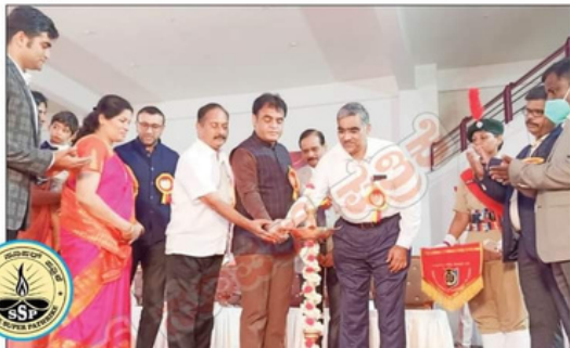
ಸ್ವೇಚ್ಛ ಸೂಪರ್ ಪತ್ರಿಕೆ ದಾಸರಹಳ್ಳಿ ವಿದ್ಯಾರ್ಥಿಗಳಾದ ನಿವೃತ್ತ ಪುನೀತ ವರ್ತಮಾನ ಪ್ರಮುಖರಾದ ಜ್ಞಾನ ಮತ್ತು ಕೌಶಲ್ಯವನ್ನು ಬೆಳೆಸಿಕೊಂಡು ಪದವಿ ಪಡೆಯುತ್ತಿರಲಿ, ಮುಂದೆ ಸಮಾಜಕ್ಕೆ ಕೊಡುಗೆ ನೀಡಬೇಕು ಎಂದು ಉತ್ತರ ಕರ್ನಾಟಕ ಸರ್ಕಾರದ ಅಧ್ಯಕ್ಷನವರು ಹೇಳಿದ್ದಾರೆ.

● ಸ್ವೇಚ್ಛ ಸೂಪರ್ ಪತ್ರಿಕೆ ದಾಸರಹಳ್ಳಿ ವಿದ್ಯಾರ್ಥಿಗಳಾದ ನಿವೃತ್ತ ಪುನೀತ ವರ್ತಮಾನ ಪ್ರಮುಖರಾದ ಜ್ಞಾನ ಮತ್ತು ಕೌಶಲ್ಯವನ್ನು ಬೆಳೆಸಿಕೊಂಡು ಪದವಿ ಪಡೆಯುತ್ತಿರಲಿ, ಮುಂದೆ ಸಮಾಜಕ್ಕೆ ಕೊಡುಗೆ ನೀಡಬೇಕು ಎಂದು ಉತ್ತರ ಕರ್ನಾಟಕ ಸರ್ಕಾರದ ಅಧ್ಯಕ್ಷನವರು ಹೇಳಿದ್ದಾರೆ.