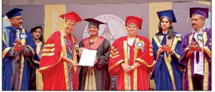
ಸೌಂದರ್ಯ ಇನ್‌ಸ್ಟಿಟ್ಯೂಟ್ ಆಫ್ ಮ್ಯಾನೇಜ್‌ಮೆಂಟ್ ಆಂಡ್ ಸೈನ್ಸ್ ಕಾಲೇಜು ಸಭಾಂಗಣದಲ್ಲಿ ವಿದ್ಯಾರ್ಥಿಗಳಿಗೆ ಪದವಿ ಪ್ರದಾನ ಮಾಡಲಾಯಿತು.